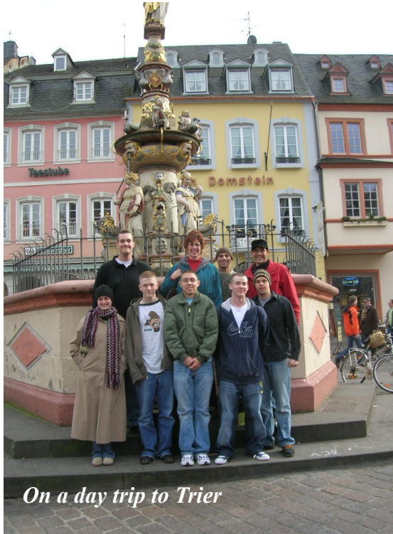
On a day trip to Trier

have come. We have opened our home for soldiers to spend the night rather than return to the barracks - 12 have taken us up on that idea. Nine people joined us on day trips of Trier and Heidelberg. Oh yea, we hosted a Super Bowl party too.