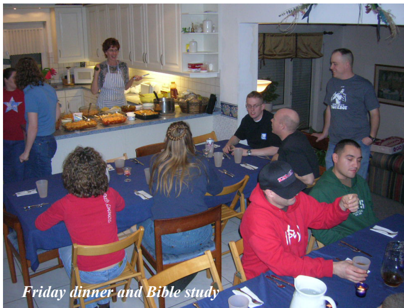
Friday dinner and Bible study

This includes ushering once so far. Thus far we have had 13 single soldiers come over for a meal whom we met at chapel, and who had not previously known of this ministry.