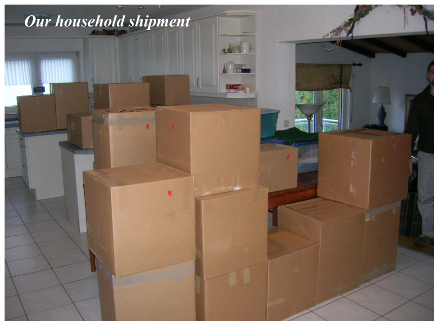
Our household shipment